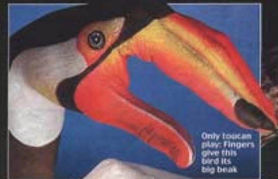
Only toucan play: Fingers give this bird its big beak