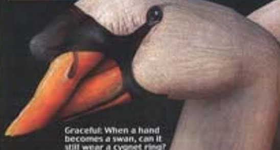
Graceful: When a hand becomes a swan, can it still wear a cygnet ring?