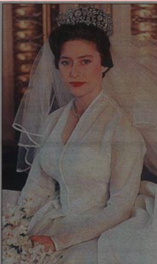
Princess Margaret's jewels, including this tiara, are going up for sale