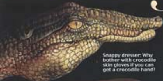
Snappy dresser: Why bother with crocodile skin gloves if you can get a crocodile hand?