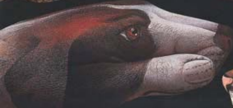
Making a point: This English Pointer seems to be on the scent of something